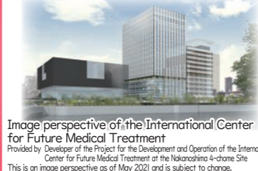
Image perspective of the International Center for Future Medical Treatment Provided by: Developer of the Project for the Development and Operation of the International Center for Future Medical Treatment at the Nakanoshima 4-chome Site This is an image perspective as of May 2021 and is subject to change.

Symbol of Aqua Metropolis Osaka utilizing water, greenery, and light