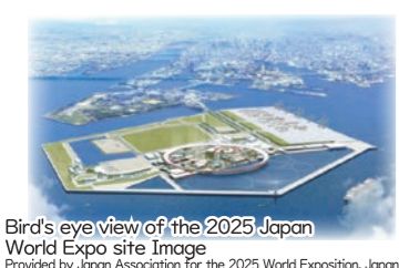
Bird's eye view of the 2025 Japan World Expo site

An international hub of tourism, logistics, and exchange