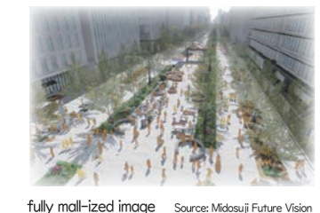
fully mall-sized image

High quality and elegant symbolic street in Osaka