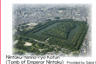
Nintoku-tenno-ryo Kofun (Tomb of Emperor Nintoku)

A hub of exceptional history, culture, and various urban functions