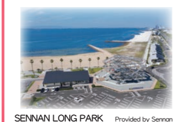
SENNAN LONG PARK Provided by Sennan City

The core of southern Senshu, a gateway of the world