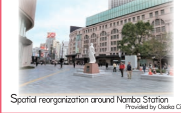
Spatial reorganization around Namba Station

A cultural tourism hub that communicates Osaka's unique attractions