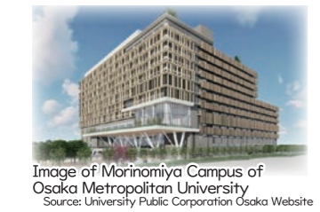
Image of Morinomiya Campus of Osaka Metropolitan University

The integration of tourism, culture, academia, and industry